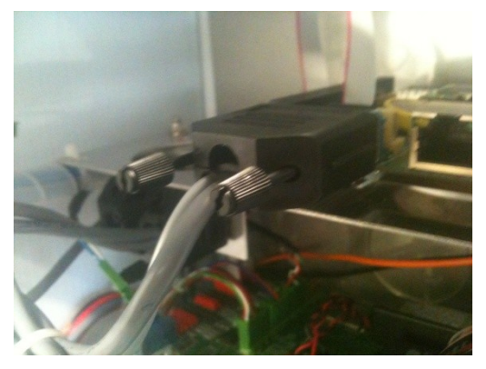
The Pinpad Cable position on the CE board