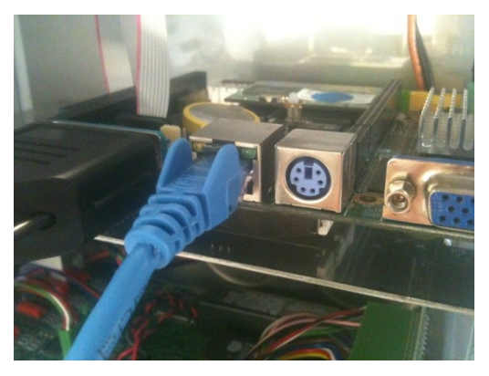
The Network cable position on the CE board

The Compac MX box needs to have the following plugs connected. All other connections are not needed when using the Compac MX Box.