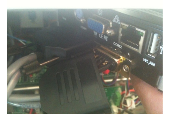
The Cardreader Cable position on the Compac MX box Note the cover may have to be removed to get the plug in (com 2)

Helpdesk assistance For any further queries regarding the above Service Advisory, contact the Compac Helpdesk on +64 9 579 1877 (Worldwide) or 1800 145 887 (Australia) helpdesk@compac.co.nz