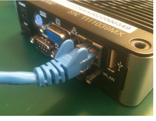
The Network cable position on the Compac MX box