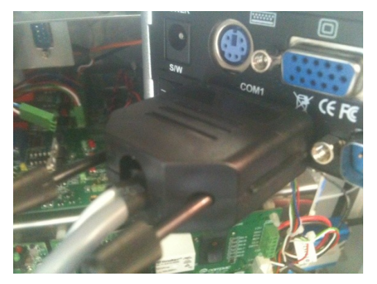
The Pinpad Cable position on the Compac MX box (com 1)