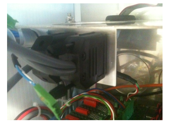
The Cardreader Cable position on the CE board