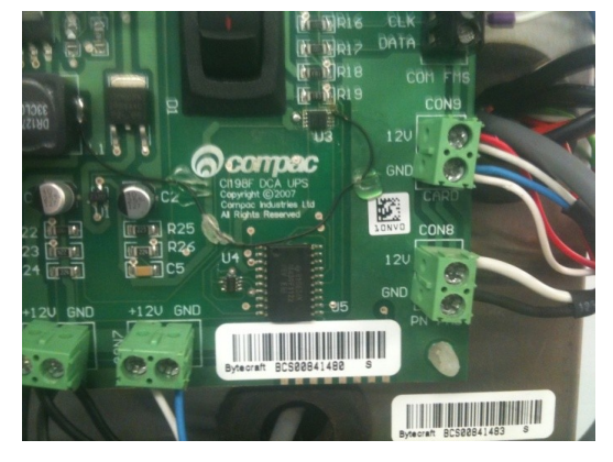
The Compac MX box can be wired into any spare 12 volt connector. The picture above shows it connected to CON8

After the 5 volt power cable has been removed the12 volt Compac MX Box cable can be installed. This is to be installed into the 12 volt DC supply terminals on the UPS board. The leads on the Compac MX box power jack will be labelled "12 volts" (White wire) and "GND" (Black wire).