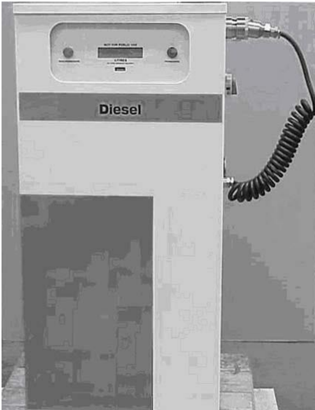
Compac Industries Model MR400S Compac Model MR400S Bulk Delivery System