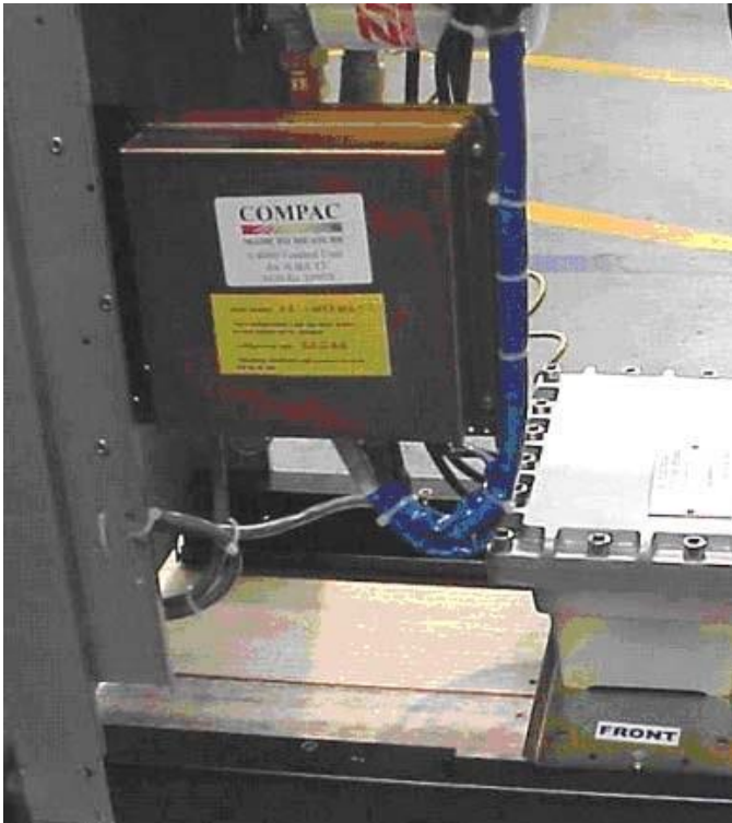
Compac Model C4000 Calculator/Indicator