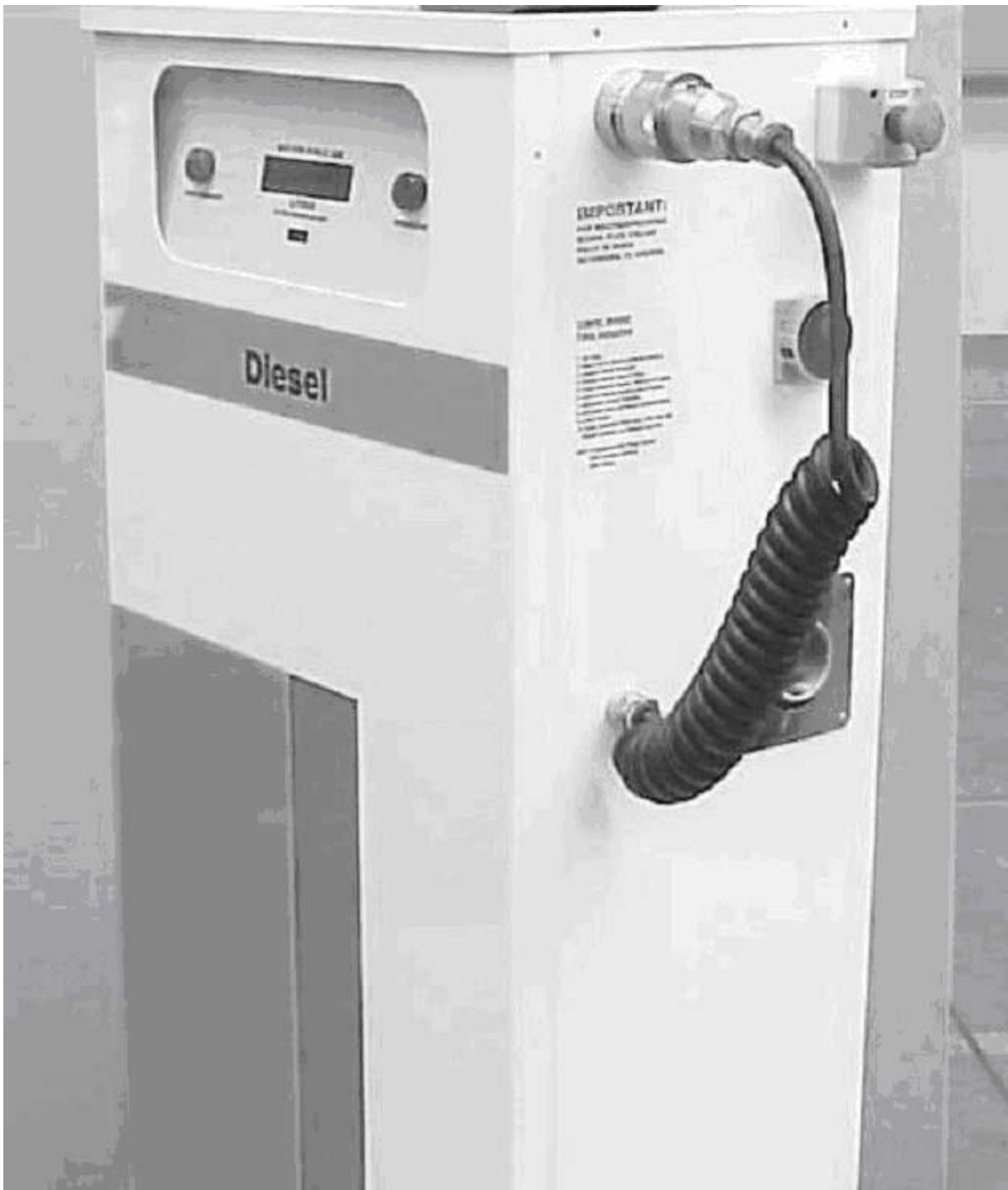
Electronic Over-fill Protection Cable and Connector