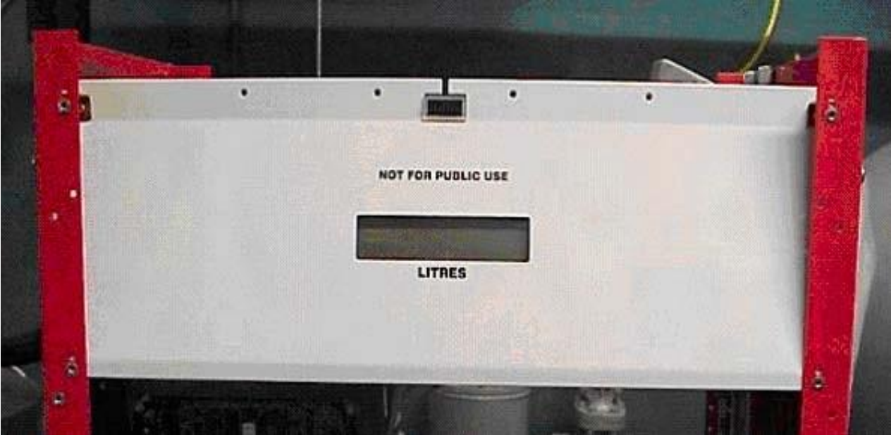
FIGURE 5/6B/208 – 4